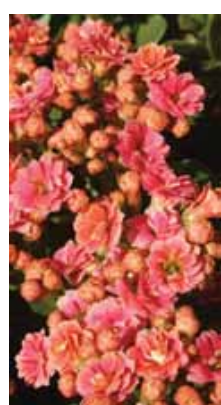
Rosalina Don Garcia Multi Coloured Pink And Cream PBR applied for