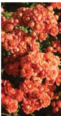
Rosalina Don Domingo Tango Red

Another super selection from the team at Aussie Winners.