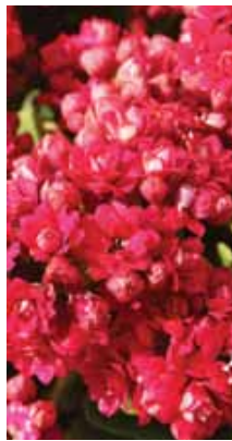
Rosalina Don Ramon Deep Pink