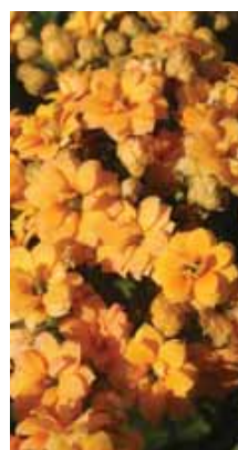
Rosalina Don Frederico Bright Yellow PBR applied for