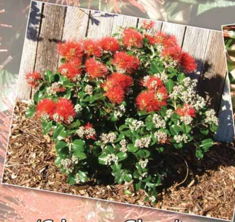
'Crimson Glory' (b)