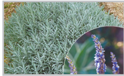
Pure Platinum Needs several very cold months to flower.